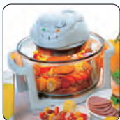
Secura Turbo Oven 777MH & 798DH