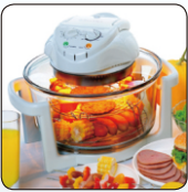
Secura Turbo Oven 777MH & 798DH