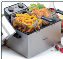
Secura Triple Basket Electric Deep Fryer