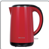
Secura Electric Water Kettle