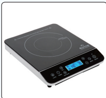
Duxtop Portable 1800W Induction Cooktop