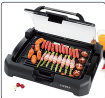
Secura 1700W Electric 2-in-1 Grill Griddle