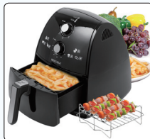
Secura Electric Hot Air Fryer