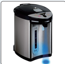
Secura Electric Hot Pot Kettle