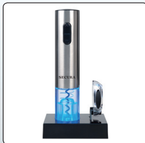
Secura Electric Wine Opener