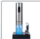
Secura Electric Wine Opener