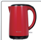
Secura Electric Water Kettle