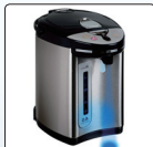
Secura Electric Hot Pot Kettle